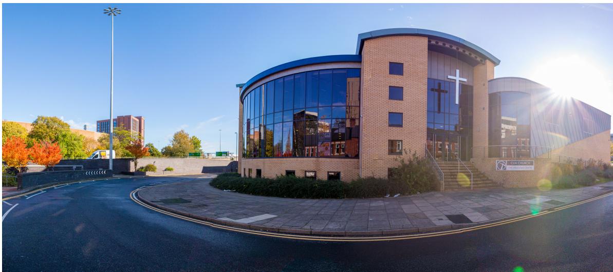
CLM Church 47 Parkside, Coventry, CV1 2HG

CLM Church is a vibrant multi-national Pentecostal church, with over 60 different nationalities represented, from across all age groups. Around 2000 people consider CLM their church home, and are in regular attendance, 40% of whom are under the age of 18.